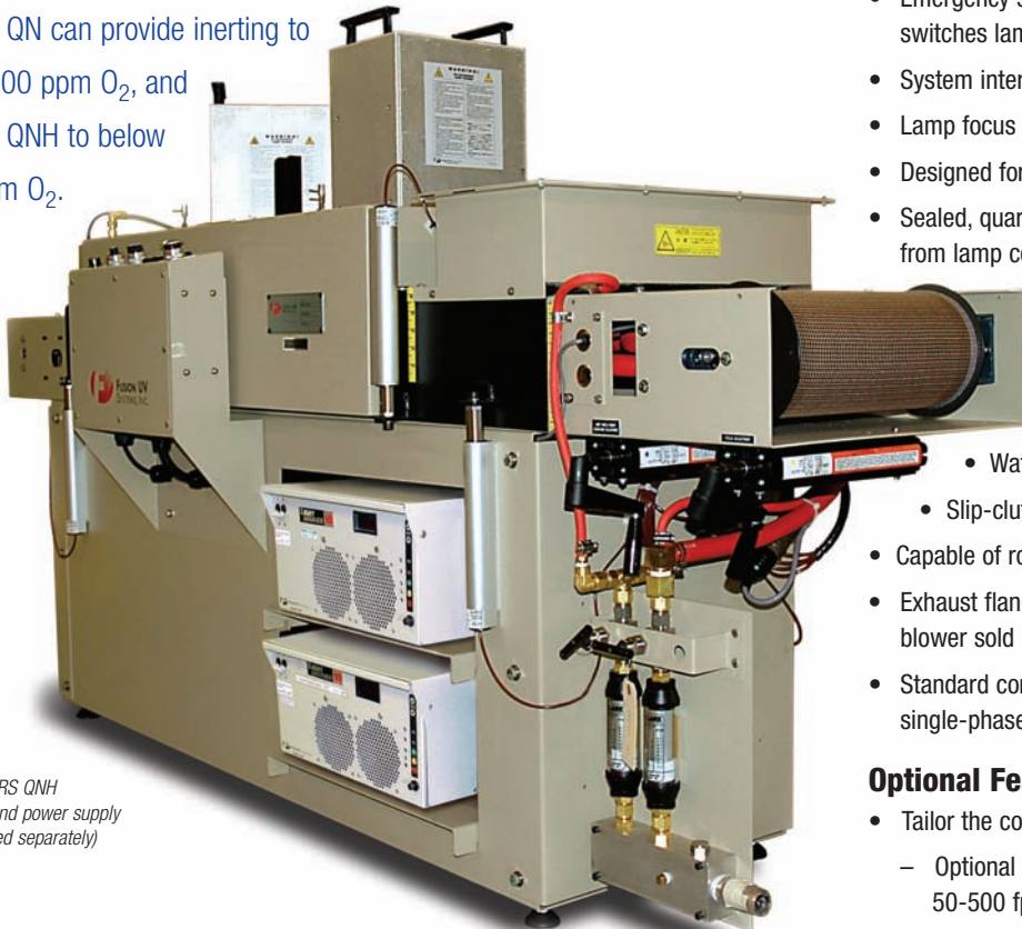
Model DRS QNH (lamps and power supply purchased separately)

The DRS QN and DRS QNH provide exceptionally low oxygen levels. Model QN can provide inerting to 500-200 ppm O 2 , and model QNH to below 50 ppm O 2 .